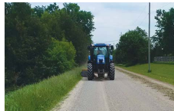
Gravel Road Restoration Machine