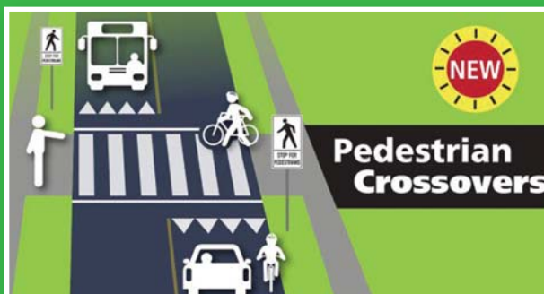
Pedestrian Crosswalk, Main Street in between Millwood Rd and Church Blvd.

Forms are available online www.erin.ca or visit us in person to sign up today.