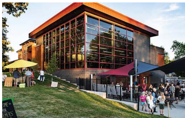
County of Wellington Hillsburgh Library